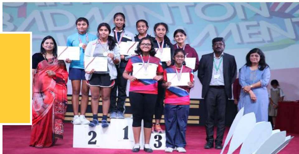
Under 17 Girls Doubles