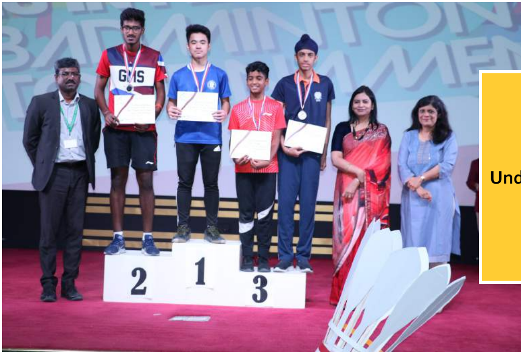
Under 17 Boys Singles