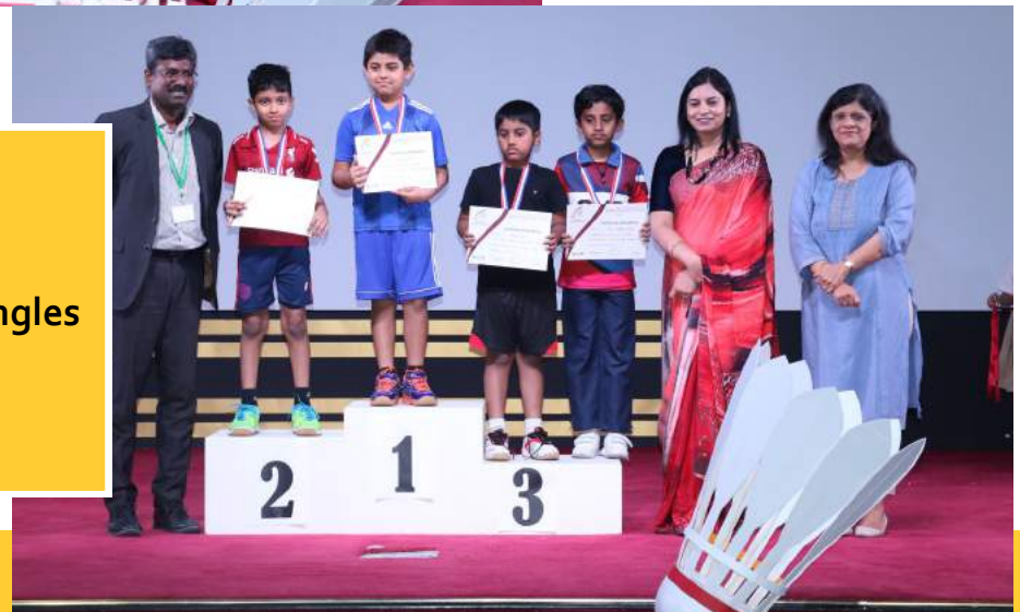
Under 9 Boys Singles