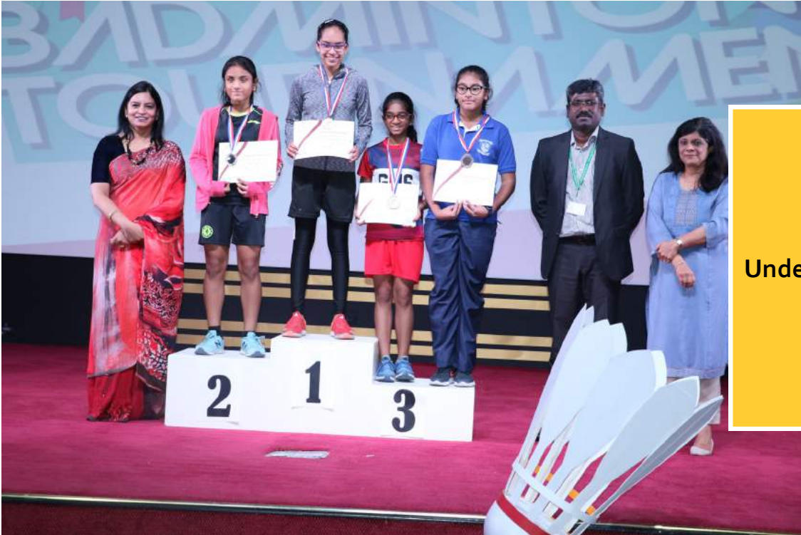
Under 13 Girls Singles