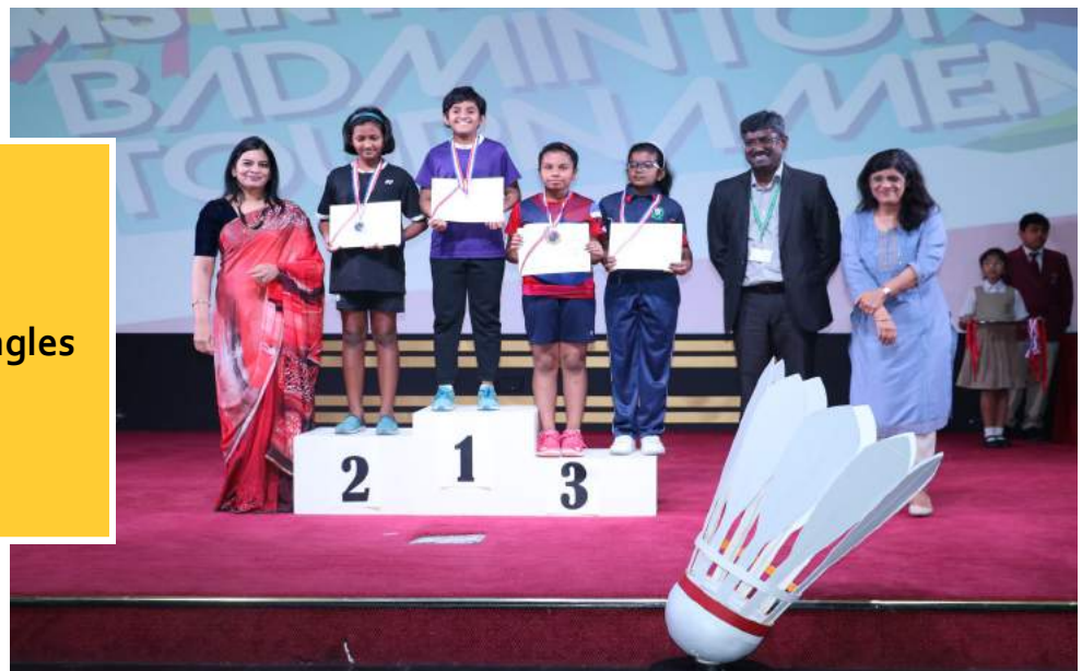
Under 11 Girls Singles