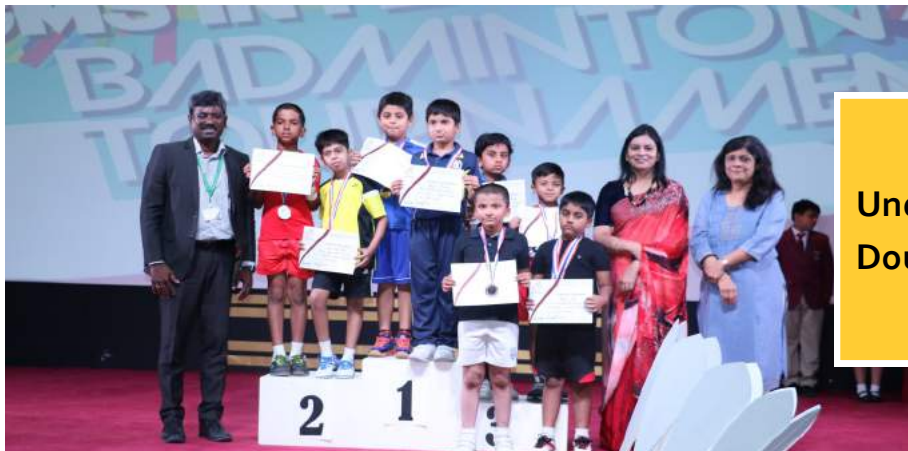
Under 9 Boys Doubles