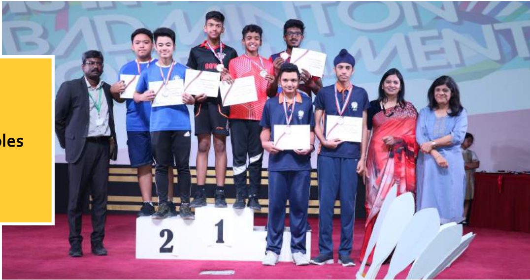
Under 17 Boys Doubles