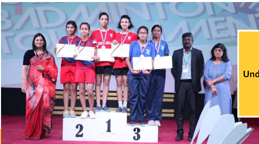
Under 13 Girls Doubles